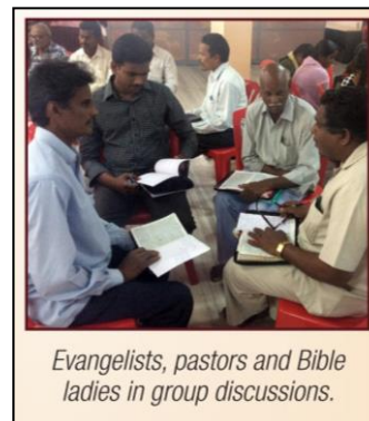
Evangelists, pastors and Bible ladies in group discussions.

So, Christianity Explored Ministries is delighted