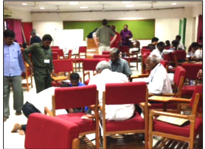
Break-out sessions during the Conference gave participants an opportunity to learn from each other.

level. The hope is that, as a transformation in the quality of preaching takes place, it will lead to the transformation of the church worldwide.